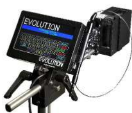
EVOLUTION Color Touch Screen Controller

EVOLUTION HP is a High Resolution Ink Jet Printer that has been designed to offer exceptional performance, virtually no maintenance and an extremely low Total Cost of Ownership in a compact, easy to use system.