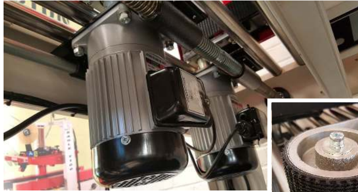
1/4HP Dual Industrial Motors